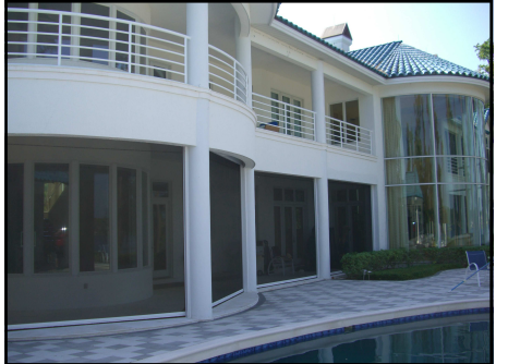
Recessed units & Archways