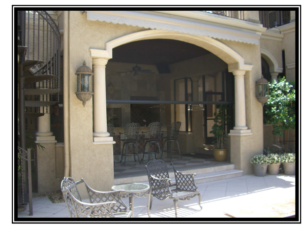
"Customized to fit your needs" www.progressivescreens.com